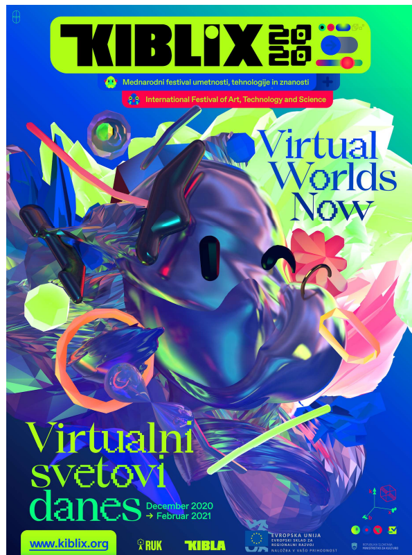
KIBLIX 2020 Visual Identity